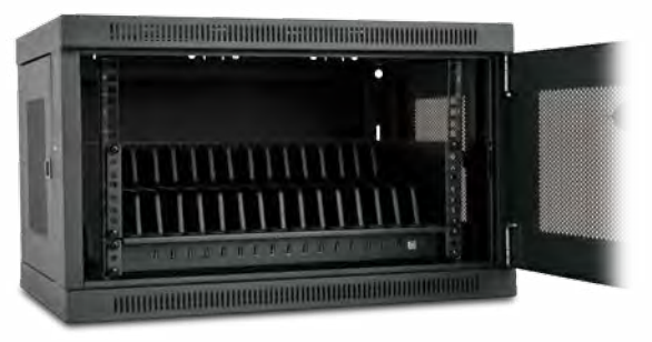
16-Device USB Charging Station