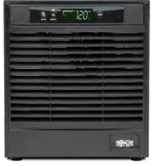
1500 VA On-Line Tower UPS