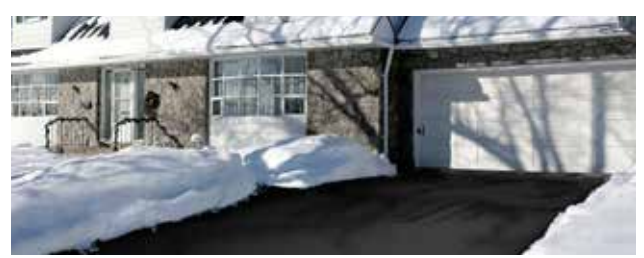
SNOW MELTING SYSTEM