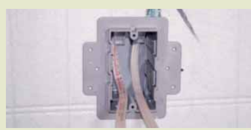
STEP 3: Pull through your NMD cable and continue

STEP 2: Insert the INEXO box into your opening and push the 'teeth' into place until you hear the 'click' – so you know your box is secure. If you are positioned next to a tie, you can utilize two of the 'teeth' on the non-tie side and use the flange holes on the opposite side to screw into the plastic tie.